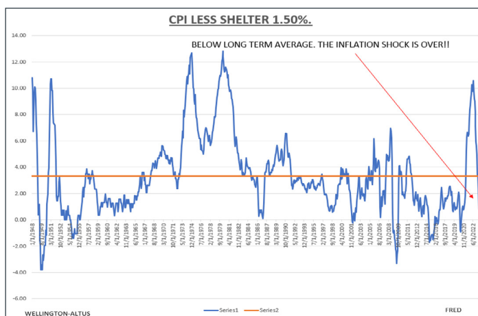
U.S. Core CPI Excluding Shelter

The intensifying forces of digitization, demographics, globalization, and debt have added complexity to the current investment environment. Our short-term base case (2024-25) suggests a return to 2.5 per cent for the Bank of Canada overnight rates by mid-2025. Investors should anticipate a rate cut of 150 bps in 2024 and not discount the possibility of a further reduction in 2025.