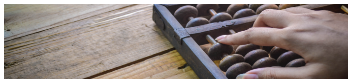
Chart: Housing Costs vs. Family Income: 1984, 2012 and Today