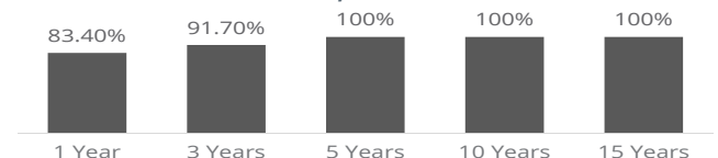
Chart 2: % of Positive Returns, Diversified Portfolio 1980 to 2020