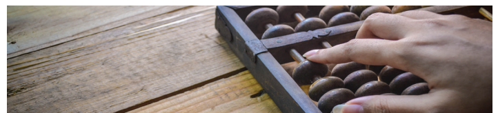
Chart: Housing Costs vs. Family Income: 1984, 2012 and Today