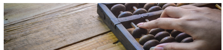
Chart: Housing Costs vs. Family Income: 1984, 2012 and Today