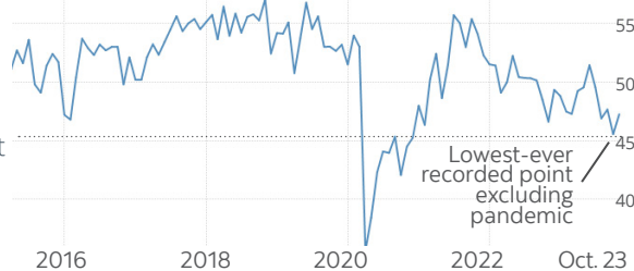
Canadian Consumer Sentiment, 2015 to 2023 6

things can often unfold much differently than predicted. Despite the many challenges, both economies and households have remained comparatively resilient.